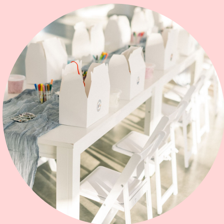
KIDS TABLES & CHAIRS $300