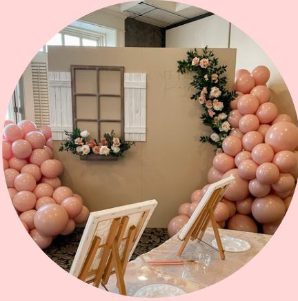
RECTANGLE PANELS 7' X 3' WIDE $150 each