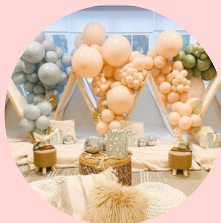
DREAMERS TINY TENT SLEEPOVERS 6 AVAILABLE $650