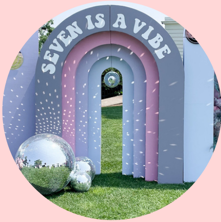
3D DEW DROP $300