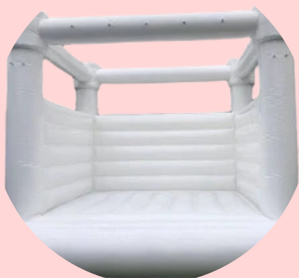
CLASSIC BOUNCE HOUSE 15'X15' $400