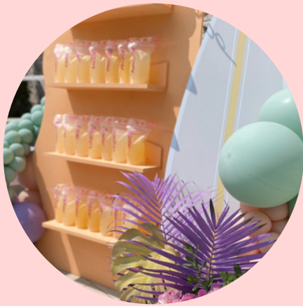
WAVE SHELF WALL $200