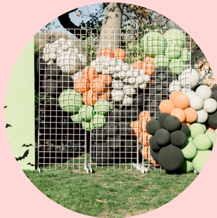
GRID WALLS $50 EACH