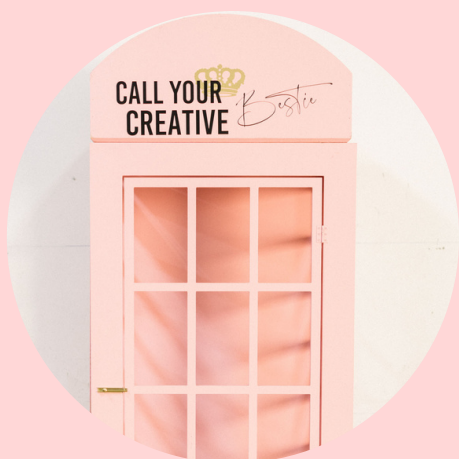
PINK PHONE BOOTH 7' TALL $300