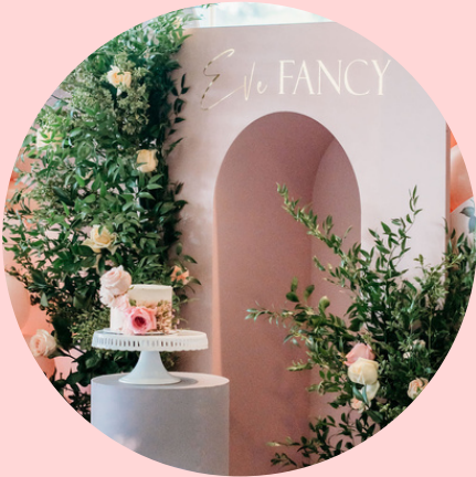
3D ARCH 6' X 4' $300