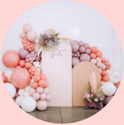
ARCH PANELS 6.5' + 4.5' $150 each