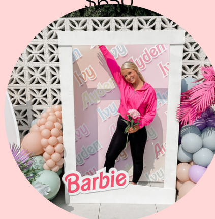
BARBIE BOX $300 Custom insert Optional