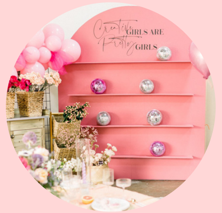
SHELF WALL MEGA $300