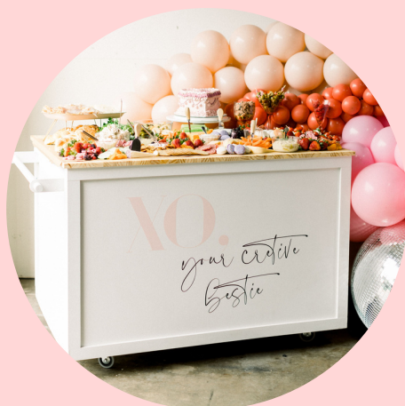
BEVVY CART $300