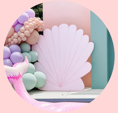
SEA SHELL PANEL $100