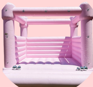
PINK LADY BOUNCE 15'X15' $400