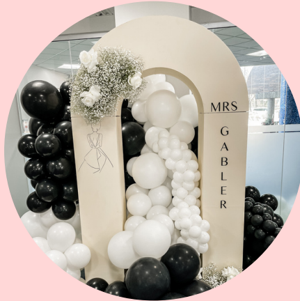
DEW DROP $200