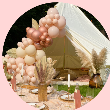
4M BELL TENT $375