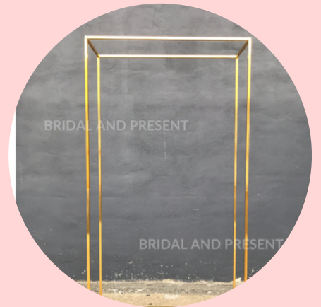
GOLD FRAMES $100 EACH