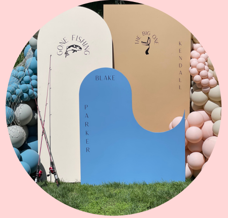
WAVE PANELS VARIOUS SIZES $150 each