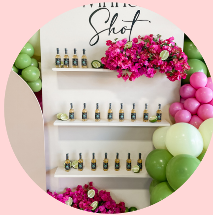
SHELF WALL STANDARD $150