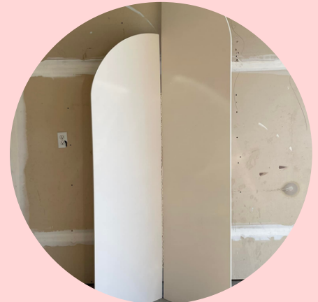
CHIARA PANELS SET $150 OR $50 EACH