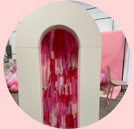
FRINGE INSERT $75