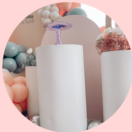
DESSERT PLINTHS $50 EACH